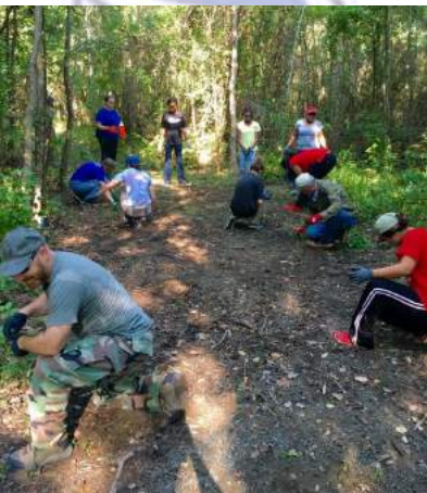
Partnership members participate in a trail clearing event at Tuten Park in Lake Charles

The Partnership For A Healthier Southwest Louisiana also drastically grew and diversified our coalition. In 2016 we added over 40 new partners from a diverse group of organizations, businesses and governments. This diversification will allow us to utilize more resources and create more of an impact.