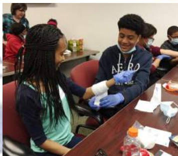
GEAR UP students practice bandaging each other

The Learning Resource Center at UHC provides medical library services to healthcare students, professionals, hospitals, and clinics in the 13 parishes of the Southwest Louisiana AHEC region.