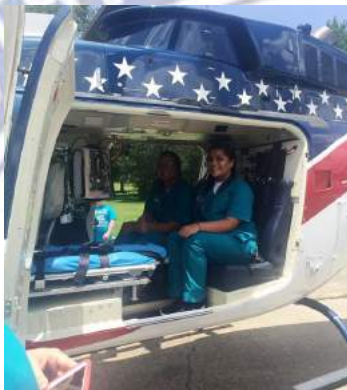
A student gets to see a "flying ambulance" firsthand